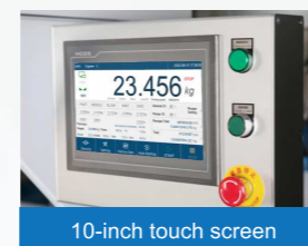
10-inch touch screen

User-friendly interface design, vivid display, easy to operate.