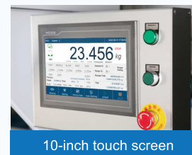
10-inch touch screen

User-friendly interface design, vivid display, easy to operate.