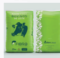
Grain and feeds