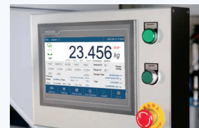
10-inch touch screen

User-friendly interface design, vivid display, easy to operate.